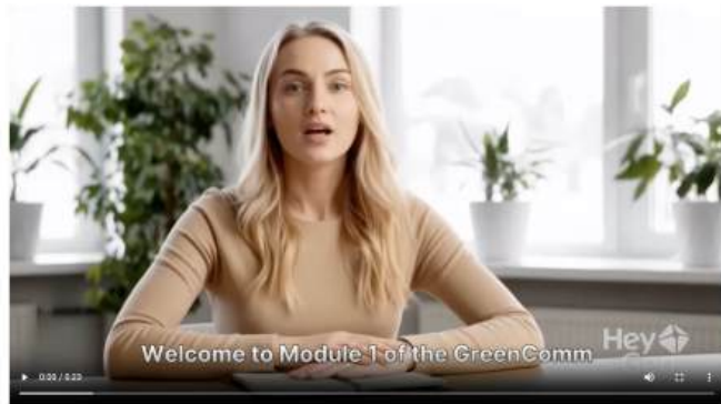
Module 1 – Scientific Data Mining and Ethical Audit Protocols: Introduction and Strategic Rationale